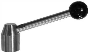
Single Lever Handle